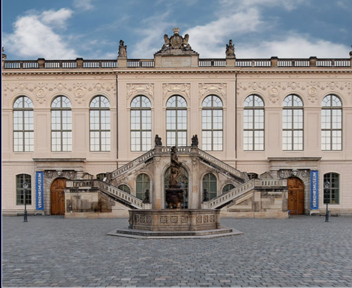
The Transport Museum at Dresden's Neumarkt square