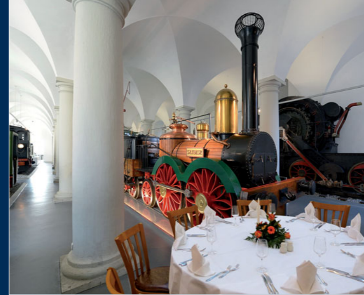
Dine next to the famous "SAXONIA" locomotive