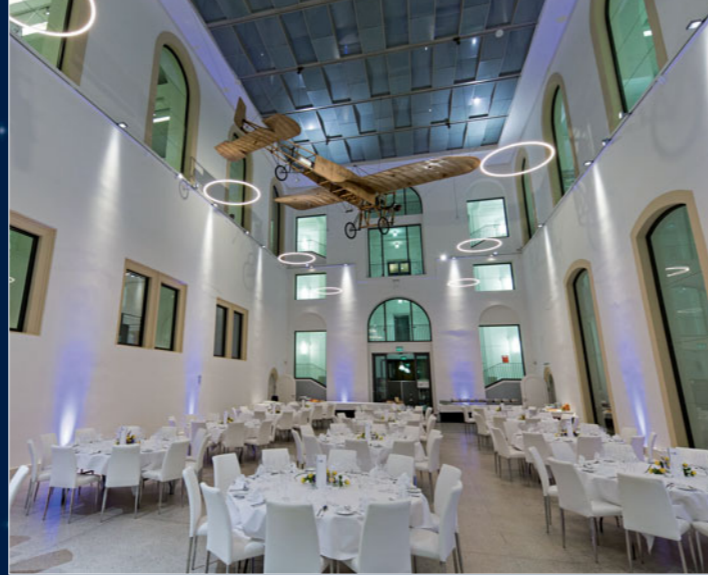
The ambience of the central atrium is impressive