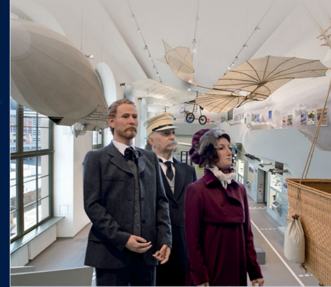
The gallery with views of the Neumarkt.